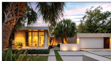
1140 CITRUS PLACE 4BR/4BA • 3,591 SF • $4,600,000