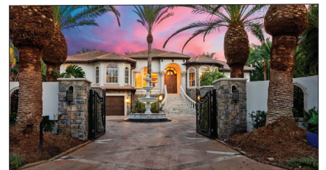
1384 HARBOR DRIVE 4BR/5BA • 4,027 SF • $6,725,000