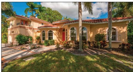
2627 PLEASANT PLACE 4BR/3BA • 3,782 SF • $1,950,000