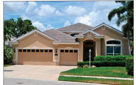
8478 SAILING LOOP 4BR/3B • 2,638 SF • $695,000.