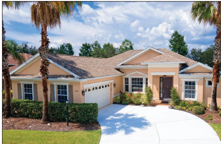
6365 ROYAL TERN CIRCLE 4BR/3B • 2,248 SF • $610,000