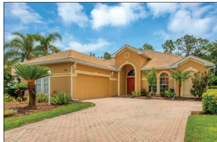
7748 U S OPEN LOOP 3BR/2B • 2,089 SF • $622,500